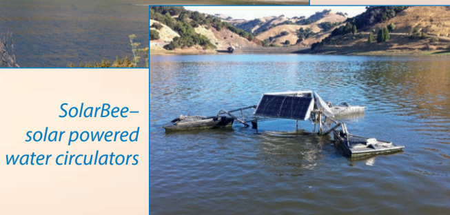
SolarBee-solar powered water circulators

Pay your bills online at: www.onlinebiller.com/nmwd