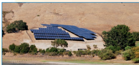
Hillside solar panels power the Stafford Lake Water Treatment Plant

Each year NMWD receives numerous inquiries about the equipment floating in Stafford Lake. Solar powered water circulators were installed back in 2006. These floating solar powered mixers circulate cooler water from a depth of 20-60 feet to the surface and aerate the lake to improve Stafford Lake water quality.